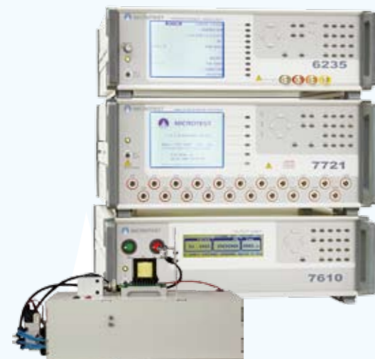
6235/7721/7610 One fixture